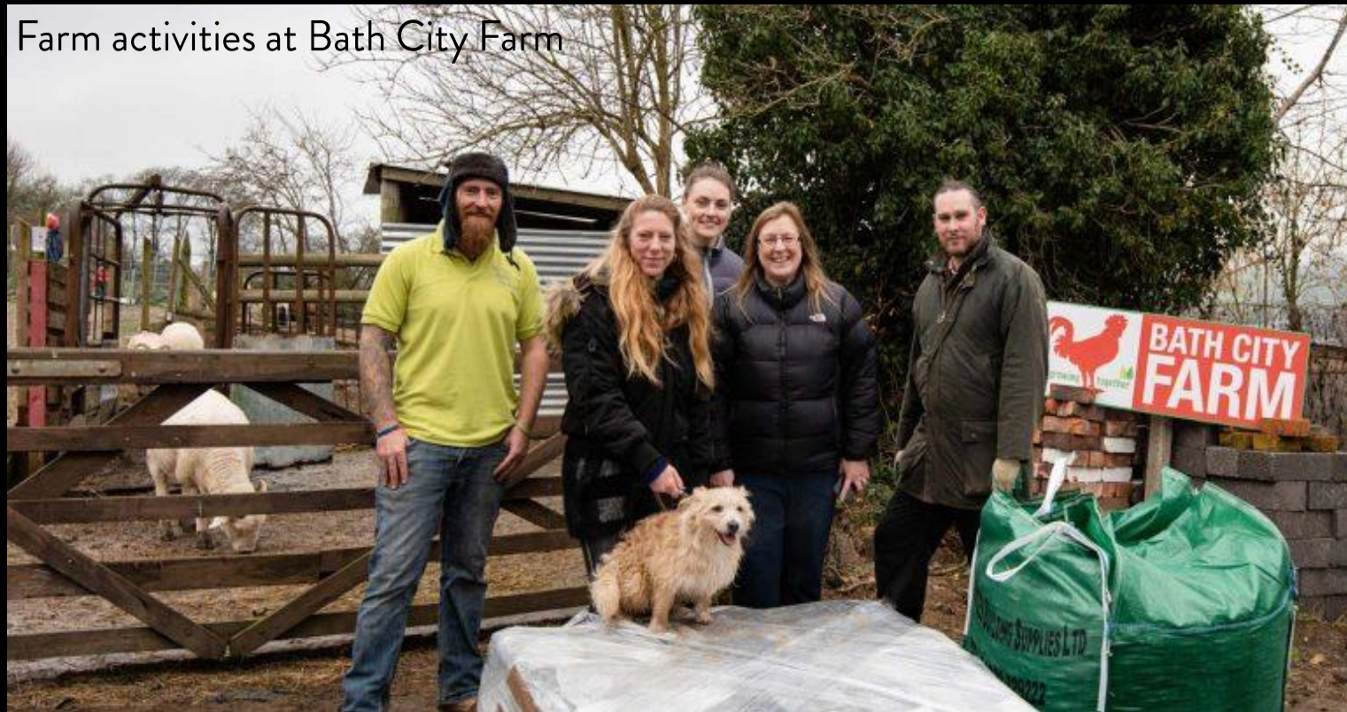
Farm activities at Bath City Farm