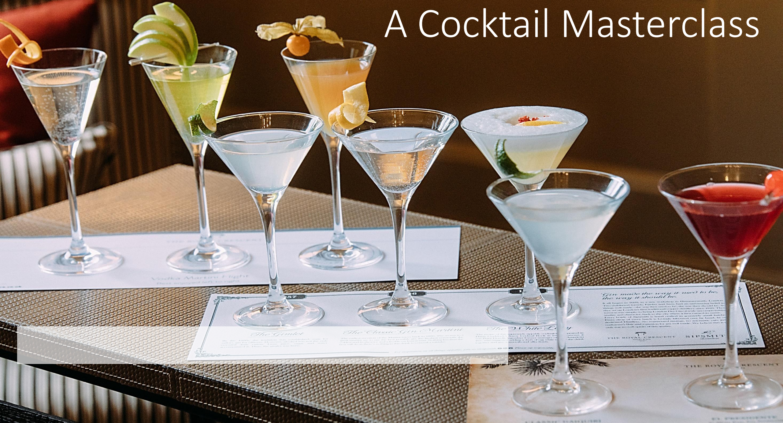
Vodka Martini Flight Best enjoyed left to right