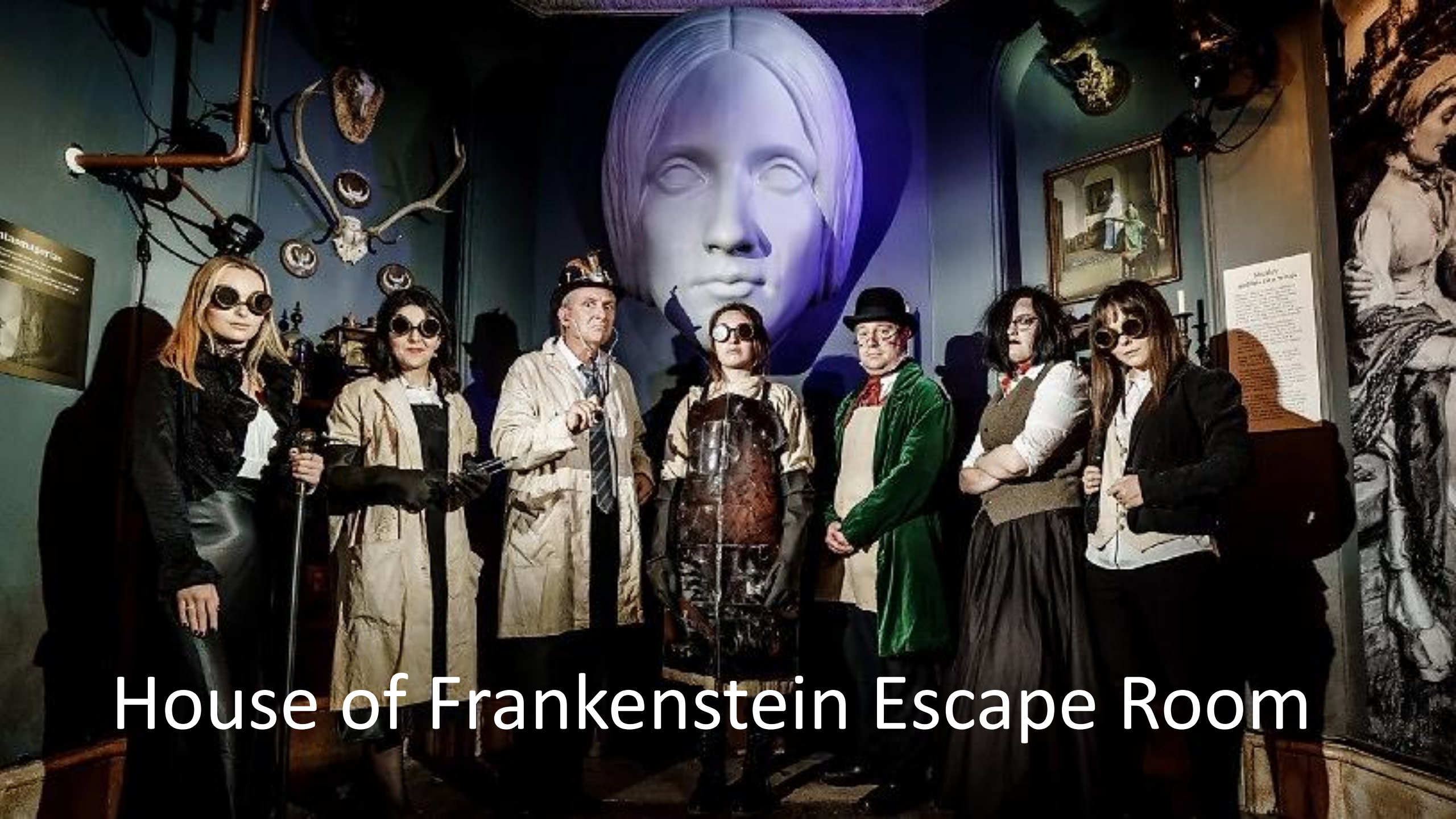
House of Frankenstein Escape Room