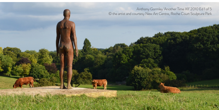
Anthony Gormley 'Another Time XII' 2010 Ed 1 of 5 © the artist and courtesy New Art Centre, Roche Court Sculpture Park

The Royal Crescent Hotel, in association with Portfolio Art Tours , offers guests a unique opportunity to create a bespoke tour of the artistic highlights of South West England.